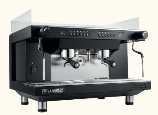
Sanremo Zoe 2 Group For up to 400 coffees per day Prices starting from £3950

We are approved dealers for Sanremo Barista machines & grinders.