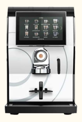
Powdered Milk Option From £3950 Rhea RHTTIC Up to 150 coffees per day