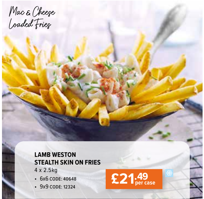
Mac & Cheese Loaded Fries