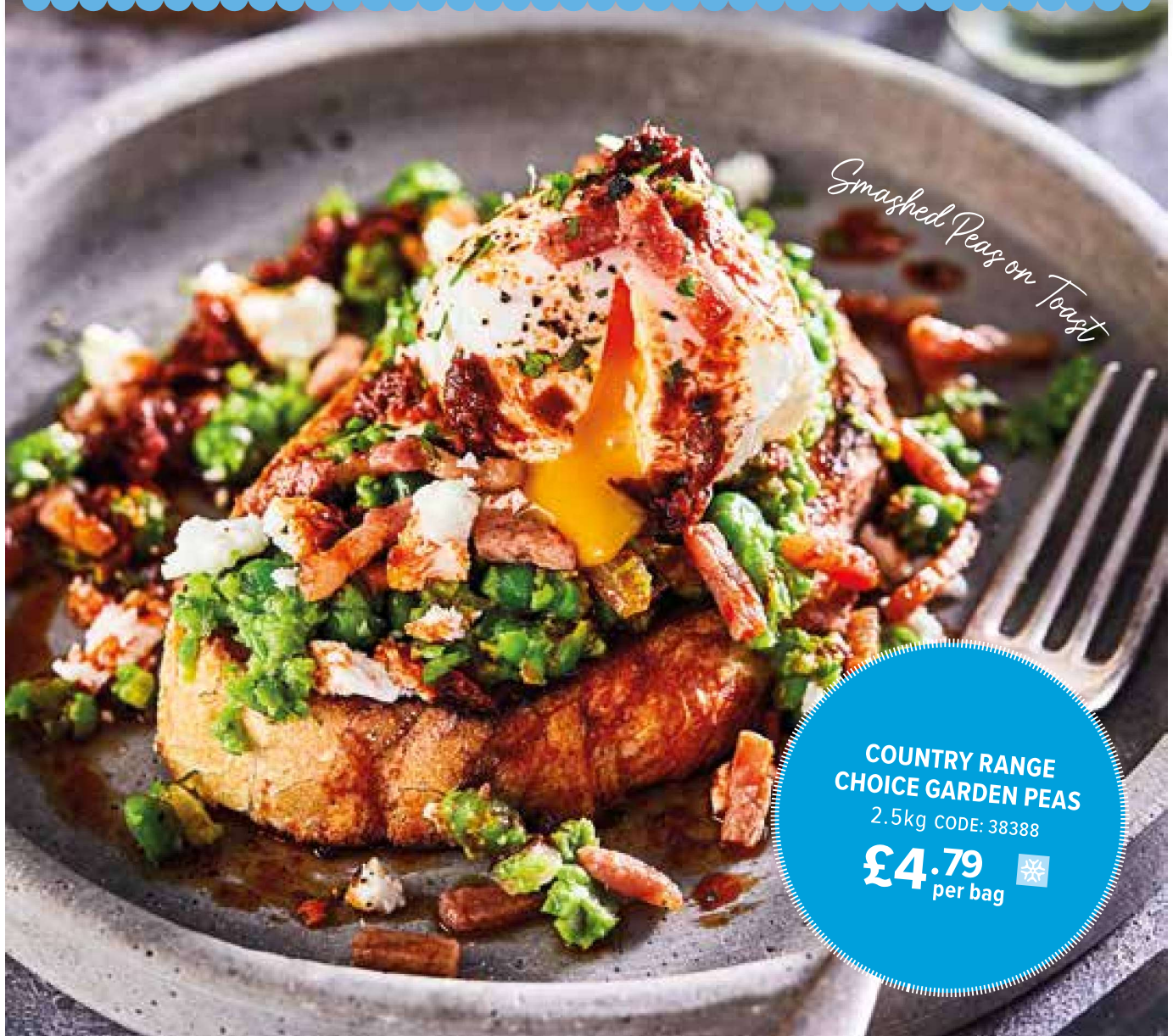
Smashed Peas on Toast