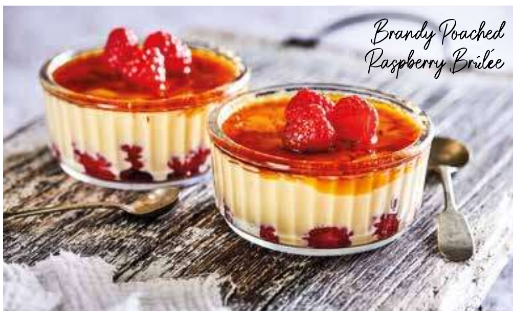
Brandy Poached Raspberry Brulee