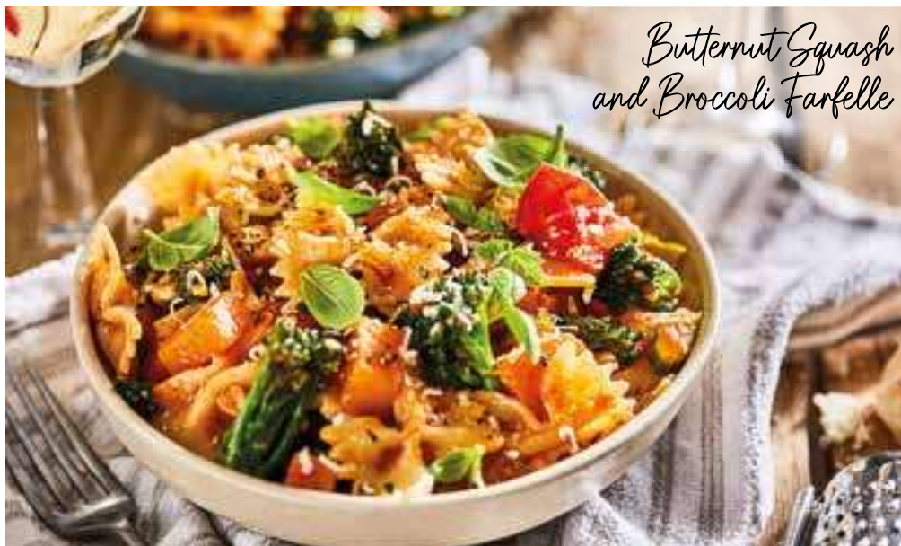
Butternut Squash and Broccoli Farfelle