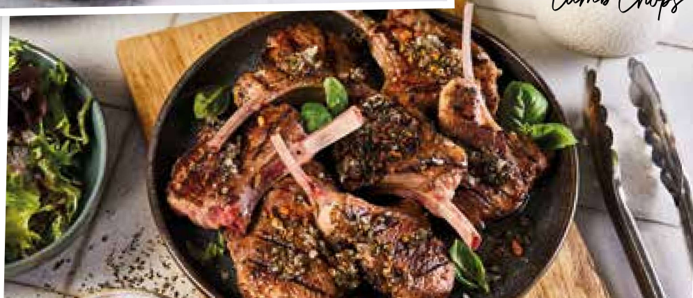
Basil Marinated Lamb Chops