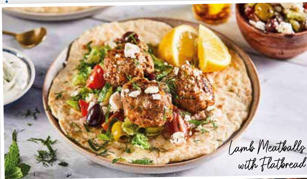
Lamb Meatballs with Flatbread

An essential ingredient in Italian and numerous tomato-based recipes and sauces, dried basil has an intense flavour, so always use less dried basil in recipes than fresh. The dried basil compliments rosemary and oregano to give a balanced flavour in marinades for olives, and is perfect in recipes that include grilled meats such as lamb, and cheeses like halloumi.