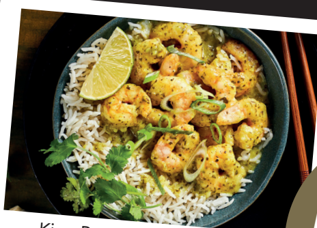
King Prawns with Thai Green Curry Sauce - 28850

Serve with a side of rice, pasta or bread as a tasty main or tapas option