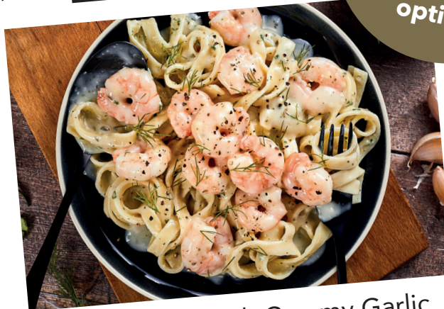
King Prawns with Creamy Garlic and Herb Sauce - 83591

Luxury seafood made simple, with a choice of Tikka Masala, Thai Green Curry, Arrabbiata, or Creamy Garlic and Herb.