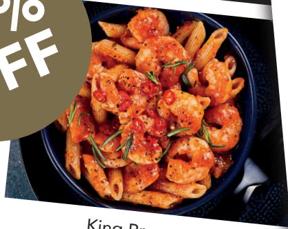
King Prawns with Arrabbiata Sauce - 49089