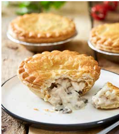
COUNTRY RANGE CHICKEN & MUSHROOM PIE 36 x 157g CODE: 36691