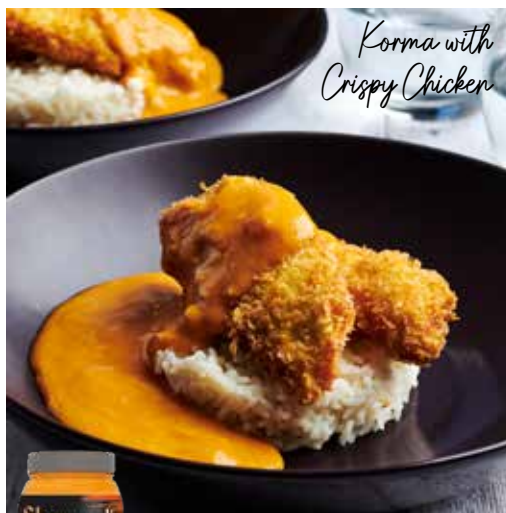
Korma with Crispy Chicken