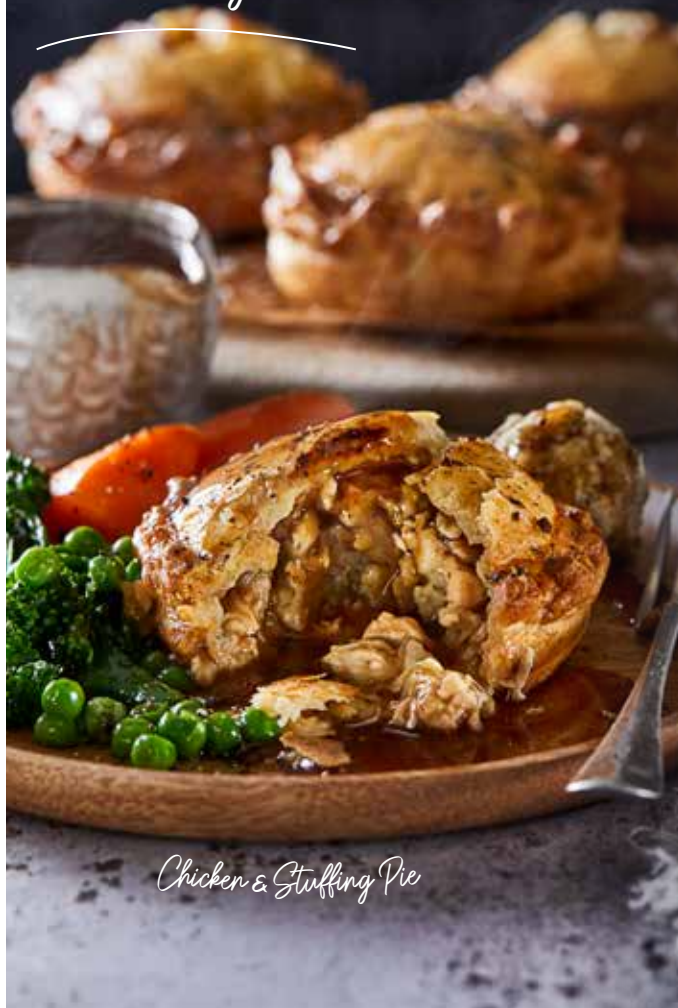
Chicken & Stuffing Pie

Check out the melting pot feature in this month's Stir it up magazine for inspiration on pastries and fillings