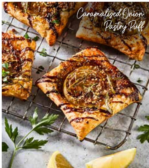
COUNTRY RANGE PUFF PASTRY BLOCK 4 x 1.5kg CODE: 66123