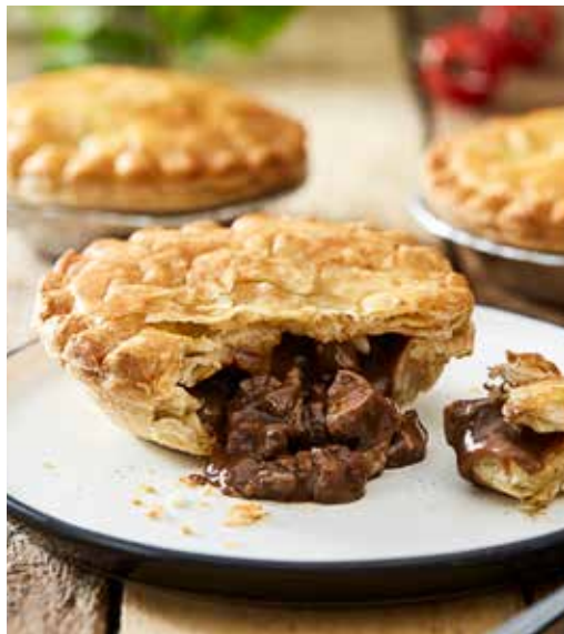
COUNTRY RANGE STEAK AND KIDNEY PIE 36 x 157g CODE: 74636