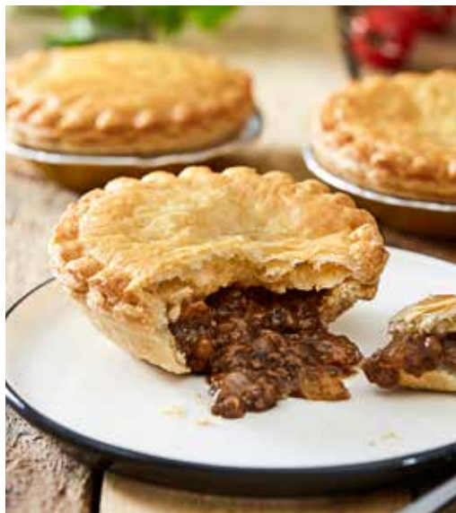
COUNTRY RANGE MINCED BEEF & ONION PIE 36 x 160g CODE: 43588