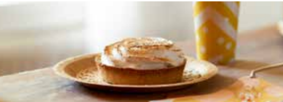
Passion Fruit & Coconut Meringue Tartlet

Passion fruit filling encased in an all butter shortcrust pastry, topped with a swirled meringue and decorated with grated coconut.