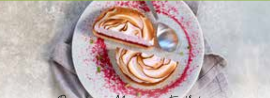
Raspberry Meringue Tartlet

A tartlet with all butter shortcrust pastry with a raspberry filling, decorated with a pink meringue "spiral".