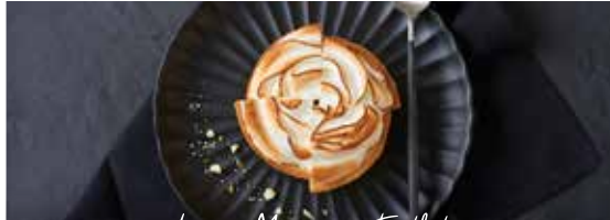
Lemon Meringue Tartlet

A tartlet with an all butter shortcrust pastry base, lemon filling and flambéed meringue.