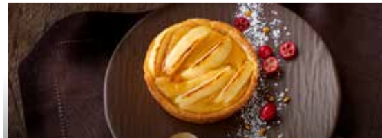
Apple Tartlet with Almond Cream

A tartlet made using all butter shortcrust pastry with an apple and almond compote, covered with apple segments.