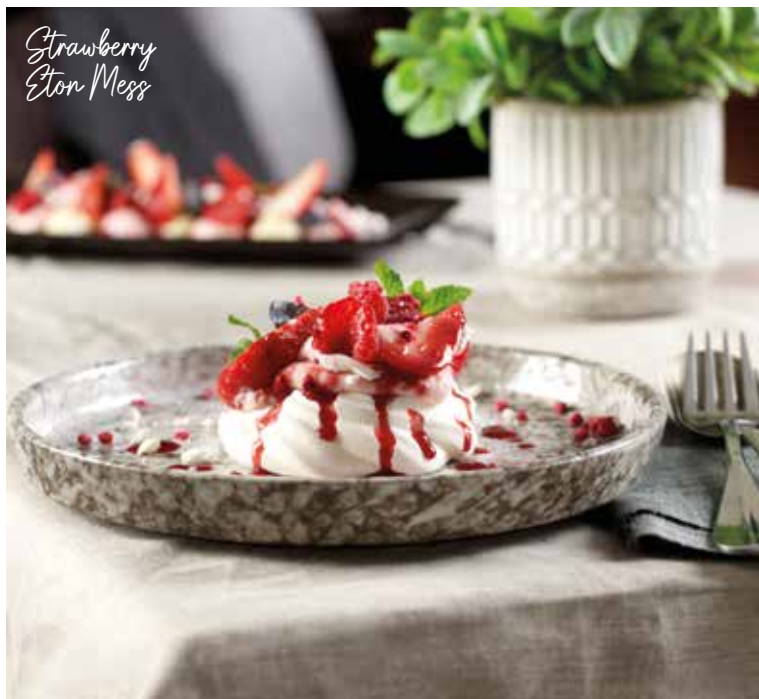
Strawberry Eton Mess