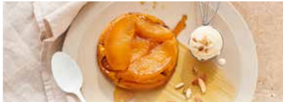
Apple Tatin Tartlet

A traditional tarte tatin in the form of a tartlet, made with an all butter shortcrust pastry.