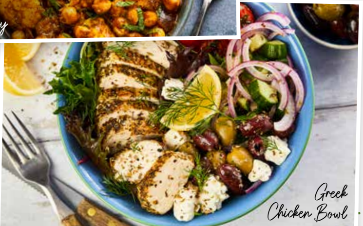
Greek Chicken Bowl