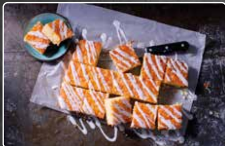
Gluten Free Lemon Drizzle Slice 50218 / 15 SQUARES