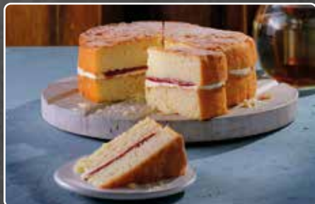
Gluten Free Victoria Sponge 38553 / 14 SLICES