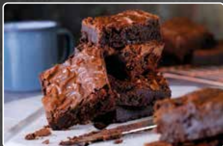
Gluten Free Chocolate Brownie 53458 / 15 SQUARES