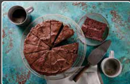
Gluten Free Chocolate Fudge Cake 78833 / 14 SLICES