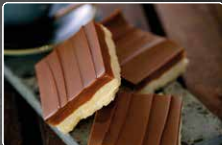
Gluten Free Caramel Shortcake 80915 / 15 SQUARES