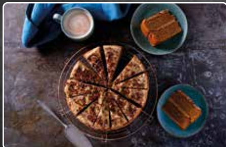
Gluten Free Cappuccino Cake 62921 / 14 SLICES