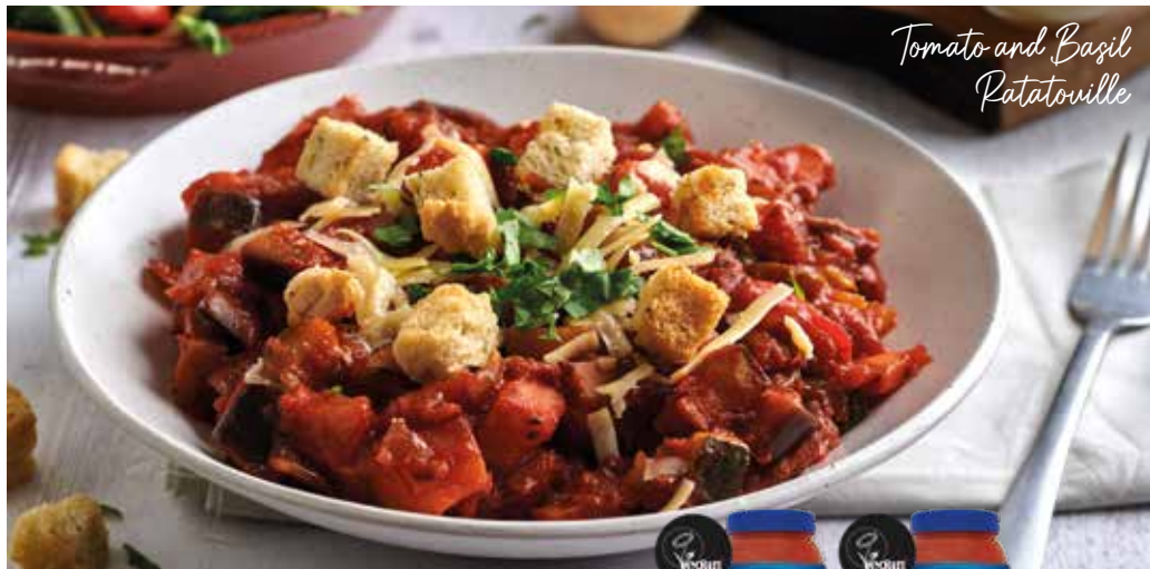
Tomato and Basil Patatoville

HOMEPRIDE SAUCES TOMATO & BASIL 2 x 2.25kg CODE: 80336