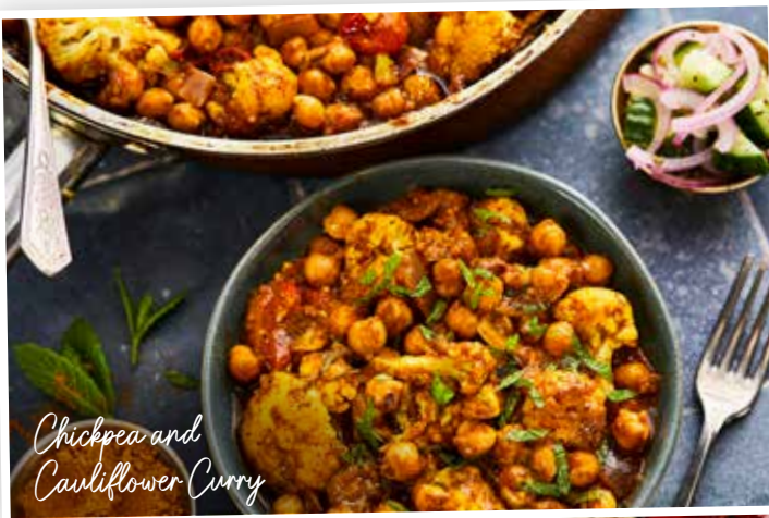
Chickpea and Cauliflower Curry

Country Range Dried Oregano is perfect with fried or roasted vegetables and grilled meats as well as enhancing the flavour of tomato-based sauces.